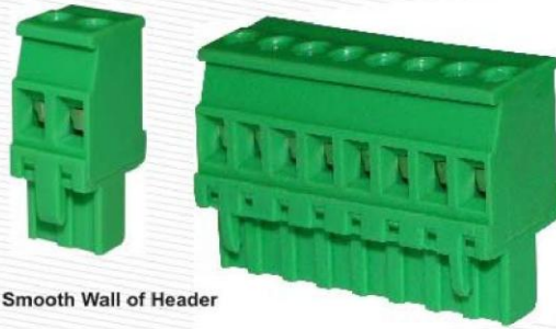
Wire Entry Towards Smooth Wall of Header

COM STRAIGHT FEMALE (Model: COM ST/'n'-F [F] where n=number of ways)