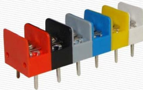
SINGLE WAY TERMINAL (Model: SWT-[C], where C is customized color)