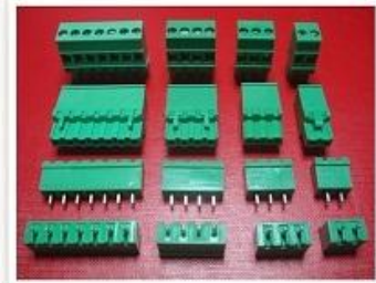
Terminal Blocks PCB Mountable