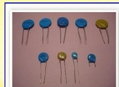
MOV's Metal Oxide Varietors