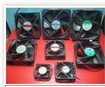
Instrument Cooling Fan